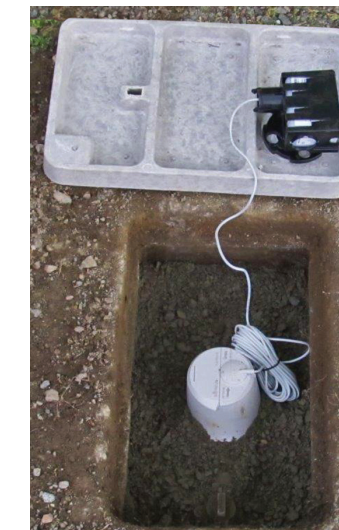
New electromagnetic meter, part of our automated meter reading system