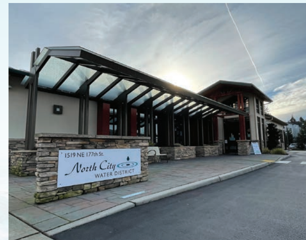
Today's Headquarters Building