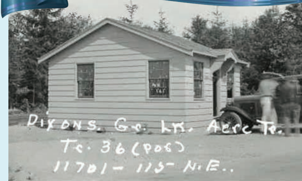
First District building constructed in 1936