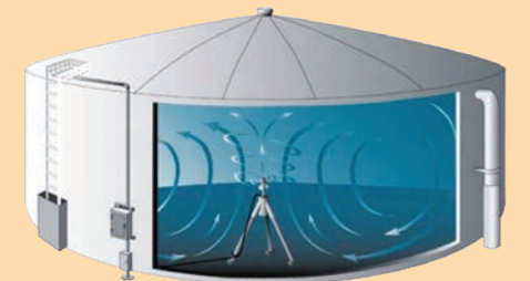
PAX Mixer action inside a reservoir; image courtesy of paxwater.com

When the District's 3.7 MG reservoir was due for routine cleaning and maintenance, we also replaced its PAX Mixer to ensure proper water movement and quality.