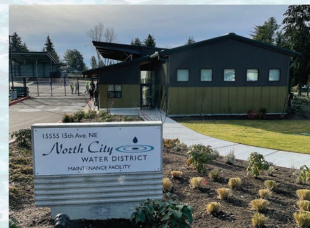
Today's Maintenance Building