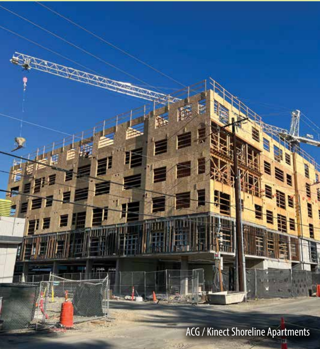
ACG / Kinect Shoreline Apartments

If you have questions about any of these projects, just give us a call at 206.362.8100.