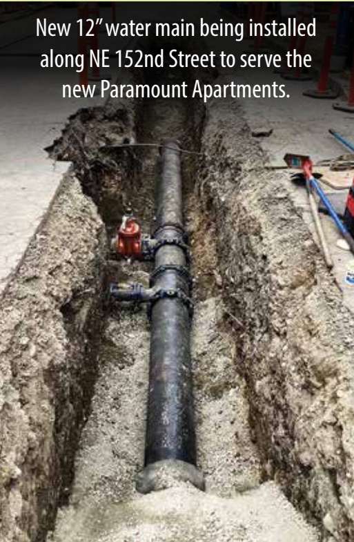
New 12" water main being installed along NE 152nd Street to serve the new Paramount Apartments.

When your crews are out working late fixing a water service, there's nothing more heartwarming than getting a hand-drawn "TANK YOU" you note from a customer. "Bennett" is quite an observant artist too... can you find all the water components he included in his drawing? Thank you Bennett... you made our whole day!