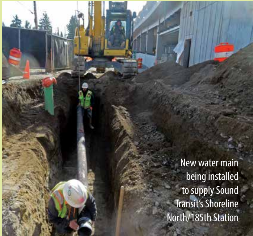
New water main being installed to supply Sound Transit's Shoreline North/185th Station