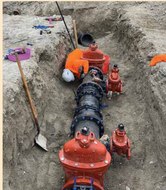
As with all of our projects, if water service to a residence or business will be impacted for any duration during construction, we will notify them several days in advance with an estimated time they'll be without water. Should you have any questions about these projects, feel free to give us a call at 206.362.8100.

Projects marked "physically complete" are finished, but need final paperwork submitted before we can officially close out their development. All other projects are either ongoing or have been completed in the last two years.